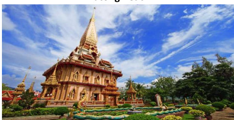
Wat Chalong Temple