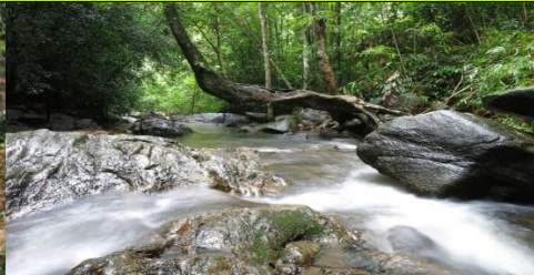
Khao Phra Thaeo Wildlife Sanctuary