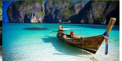
Phi Phi Island